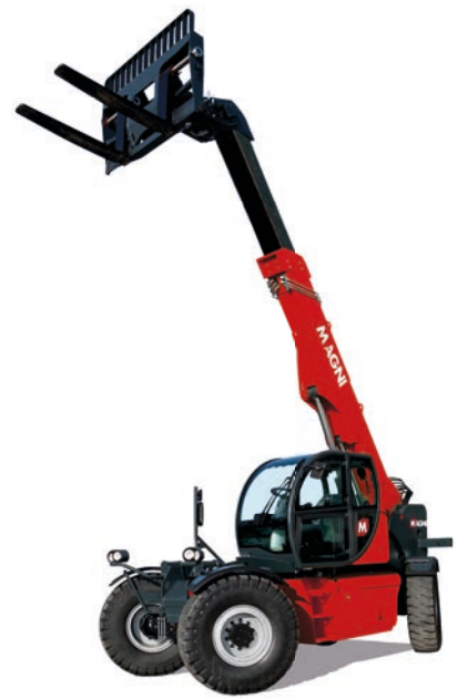
Load chart forklift with forks positioner